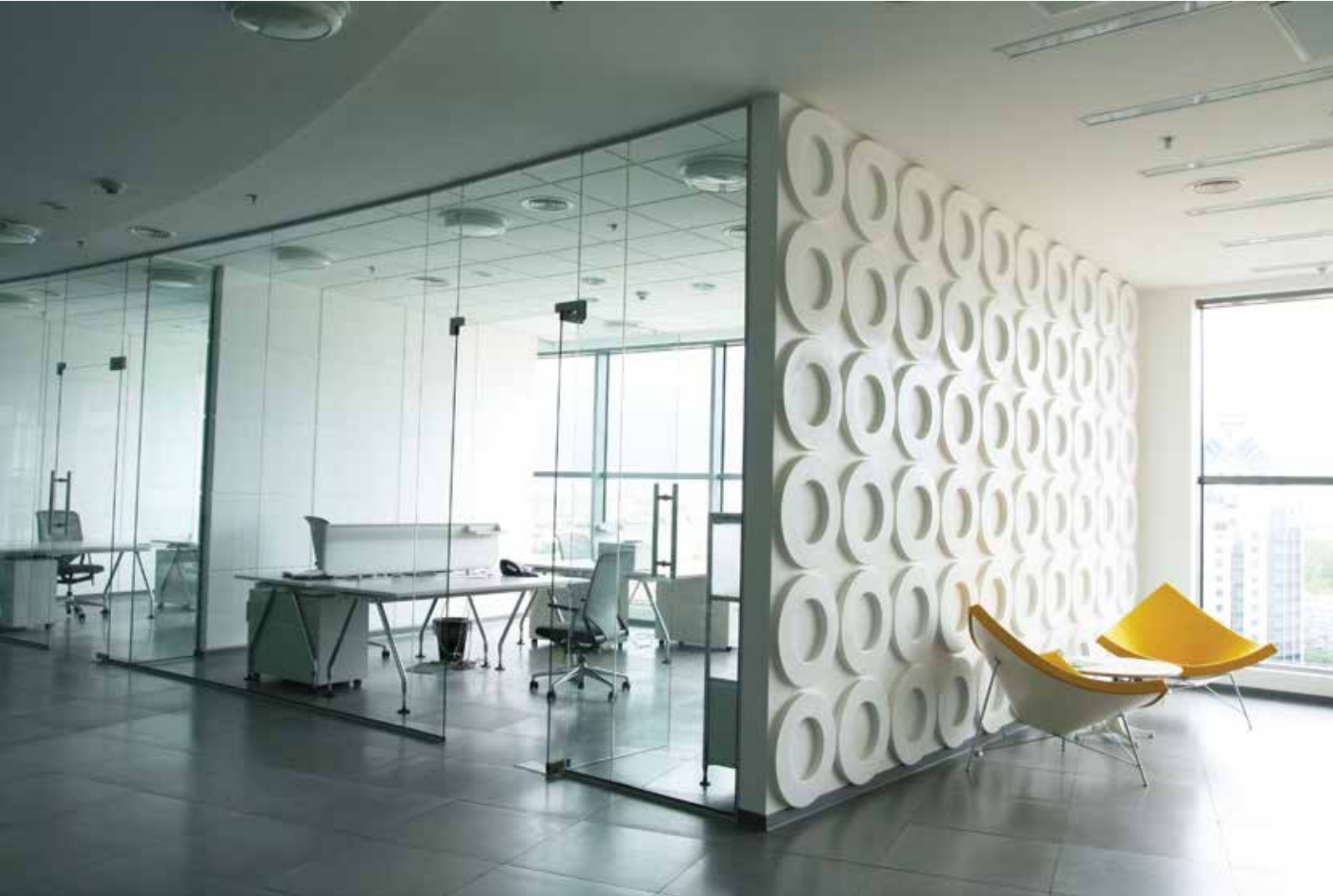
Commercial Space Planning